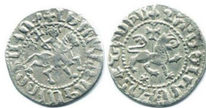
CILICIAN ARMENIA LEVON III – 1301-1307

Estimate: 30 EUR. Price realized: 80 EUR (approx. 123 U.S. Dollars as of the auction date)