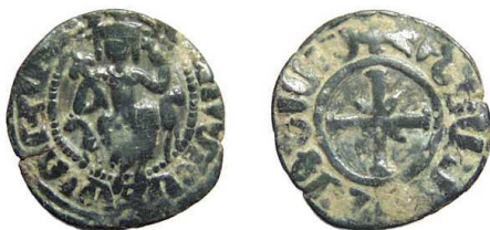
CILICIAN ARMENIA Hetoum I., 1226 - 1270.

+ՇԻՆԵԱԼ Ի ՔԱՂԱՔՆ Ի ԱԱ “Struck in the city of Ayas”