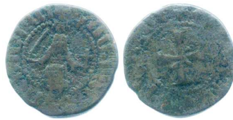
CILICIAN ARMENIA Gosdantin I – 1299

+ԿԱՐՈ ... ԹԲՆ ԱՅ Ե ԹԱԳԱԻՈՐ “By the Will of God is he King”