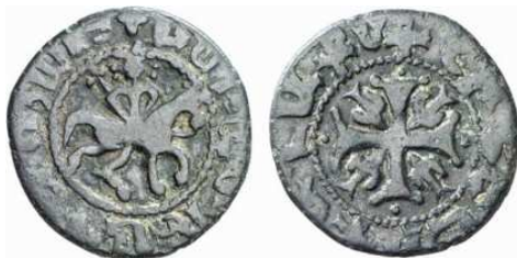
CILICIAN ARMENIA Smbat, 1269-1298.

...ՔԱՂԱՔ ՄԻ... “Struck in the city of Sis”