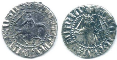
CILICIAN ARMENIA Gosdantin I – 1299