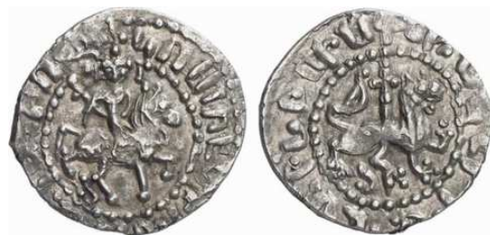
CILICIAN ARMENIA GOSDANTIN IV – 1365-1373

+ՇԻՆ ... Ի Ս “Struck in the city of Sis”