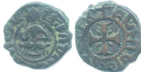
CILICIAN ARMENIA LEVON III – 1301-1307

~ These Kardez' are very distinct due to their workmanship and completeness of inscription. Most types in this series are much more crude and struck with carelessly engraved dies.