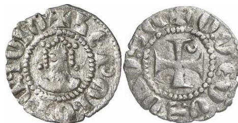
CILICIAN ARMENIA HETOUM II – 1289-1293, 1295-1296, 1299-1301, 1301-1306