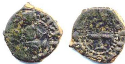
CILICIAN ARMENIA LEVON III – 1301-1307

+ՇԻՆԵԱԼ ՔԱՂԱՔՆ Ի ՄԻՍ “Struck in the city of Sis”