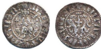
CILICIAN ARMENIA Oshin, 1307-1320.

Estimate: 100 EUR. Price realized: 400 EUR (approx. 613 U.S. Dollars as of the auction date)