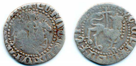
CILICIAN ARMENIA LEVON II – 1270-1289

+ՇԻՆԵԱԼ Ի ՔԱՂԱՔՆ Ի ՍԻՍ “Struck in the city of Sis”