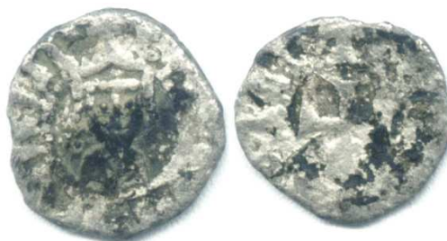
CILICIAN ARMENIA Levon V., 1374-1375.

AE "Billon." 15 mm, 1.00 gm. Wrong metal, unique.