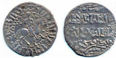
CILICIAN ARMENIA Hetoum I., 1226 - 1270.