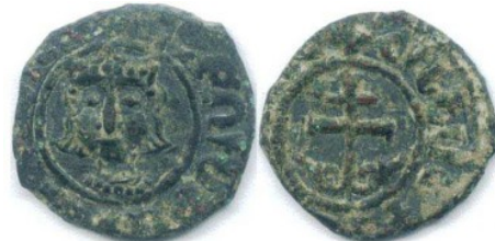
CILICIAN ARMENIA HETOUM II – 1289-1293, 1295-1296, 1299-1301, 1301-1306 AE Kardez, Sis mint. 4.1 g., 22 mm.

...ԹՈՒՄ ԹԱԳԱՒ... “Hetoum King of Armenians”