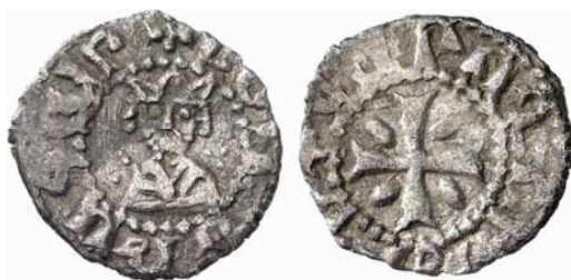
CILICIAN ARMENIA Levon V., 1374-1375.