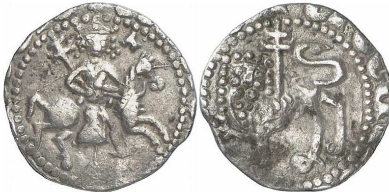
CILICIAN ARMENIA LEVON III – 1301-1307

In August, 1307, Leo and Hethum were murdered with their retinue while visiting the Mongol emir Bilarghu at Anazarva. He was succeeded as king by his uncle, Oshin.