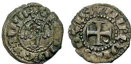
CILICIAN ARMENIA HETOUM II – 1289-1293, 1295-1296, 1299-1301, 1301-1306