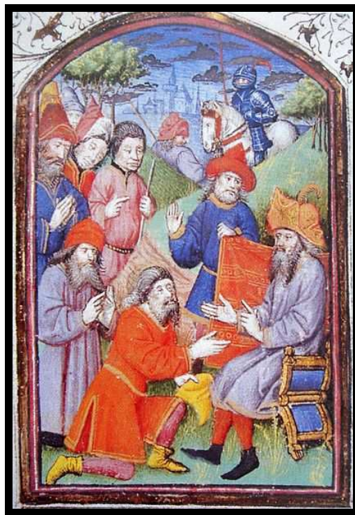
Hetoum I (seated) in the Mongol court of Karakorum, "receiving the homage of the Mongols".[1] Miniature from "Histoire des Tartars", Hayton of Corycus, 1307.

Hetoum abdicated in 1270 in favor of his son Leo II, and lived out the rest of his life in a monastery, as a Franciscan monk.