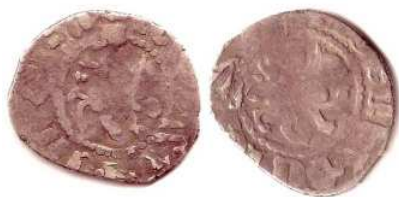
CILICIAN ARMENIA LEVON IV – 1320-1342

AR Surcharge Takvorin. Sis mint host. 17-21 mm.