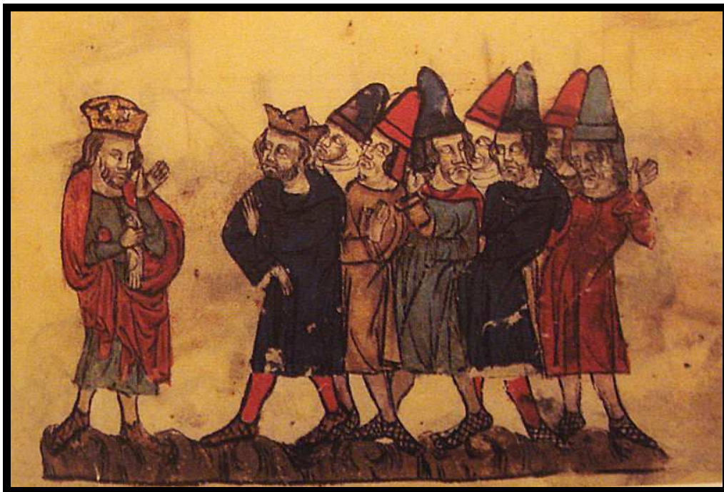
Hetoum II (left) parting from Ghazan and his Mongols in 1303.

In 1307, Hetoum II and Leon III were assassinated by the Mongol general of Cilicia, Bilarghu, following an internal plot against Hetoum's efforts to unite the Armenian Church with Rome.