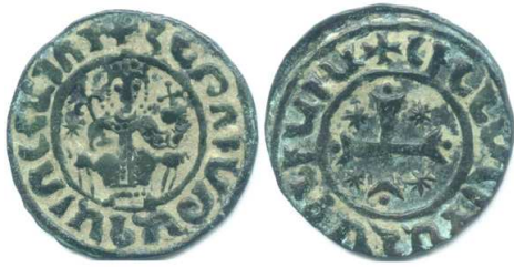
CILICIAN ARMENIA Hetoum I., 1226 - 1270.