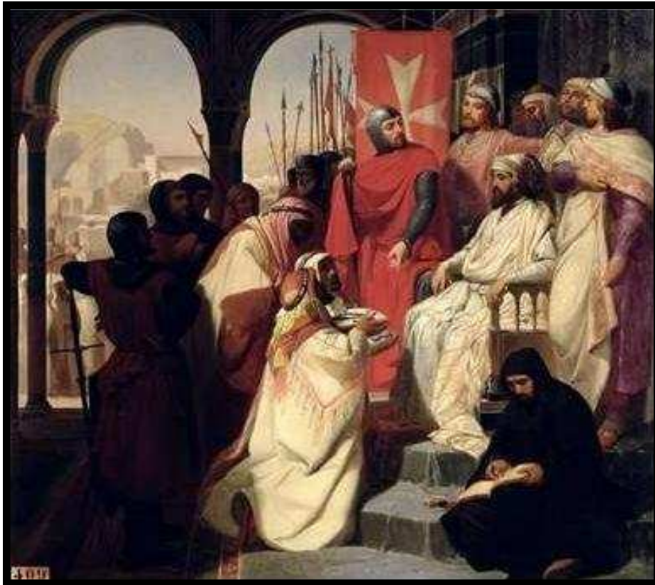
Constantin III of Armenia on his throne with the Hospitallers. "Les chevaliers de Saint-Jean-de-Jerusalem rétablissant la religion en Arménie" ("The knights of Saint-John of Jerusalem reestablish the religion in Armenia"), 1844 painting by Henri Delaborde.

Constantine was the first husband of Maria, daughter of Oshin of Corycos and Jeanne of Anjou. He was predeceased by his two sons. Upon his death from natural causes he was succeeded by his cousin Constantine IV.