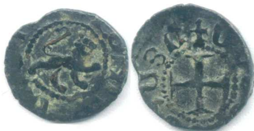
CILICIAN ARMENIA Levon V., 1374-1375.