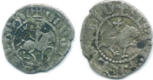
CILICIAN ARMENIA GOSDANTIN IV – 1365-1373

Constantine formed an alliance with Peter I of Cyprus, offering him the port and castle of Corycus. On Peter's death in 1369, Constantine looked for a treaty with the Sultan of Egypt. The barons were unhappy with this policy, fearing annexation by the sultan, and in 1373 Constantine was murdered. Upon his death he was succeeded by his distant cousin Leo V, who would become the last king of Cilician Armenia.