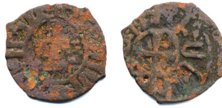
CILICIAN ARMENIA HETOUM II – 1289-1293, 1295-1296, 1299-1301, 1301-1306 AE Kardez, Sis mint. 20 mm

Estimate: 25 EUR. Price realized: 40 EUR (approx. 61 U.S. Dollars as of the auction date)