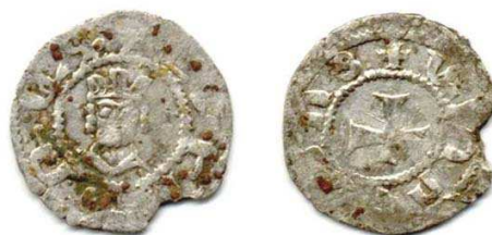
CILICIAN ARMENIA Levon V., 1374-1375.

Estimate: 50 EUR. Price realized: 360 EUR (approx. 552 U. S. Dollars as of the auction date)