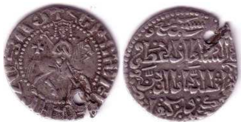
CILICIAN ARMENIA Hetoum I., 1226 - 1270.

Dram. Citing Kaykhusraw II, A.H. 637/AD 1239 22-23 mm