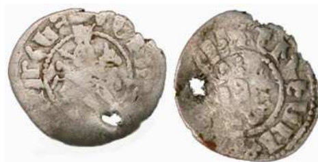
CILICIAN ARMENIA LEVON IV – 1320-1342

...ՆԵԱԼ Ի ՔԱՂ... “Struck in the city of Sis”