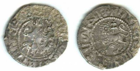
CILICIAN ARMENIA Levon I – 1199-1219

+ԿԱՐՈՂՈՒԹԵՆ ԱՍՏՈՒԾՈՅ “By the Will of God”