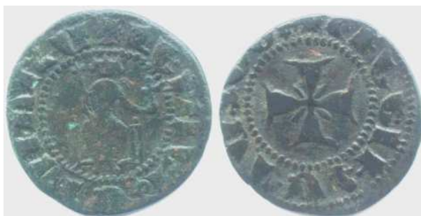
CILICIAN ARMENIA LEVON IV – 1320-1342

+ՇԻՆԵԱԼ Ի ՔԱՂԱՔՆ ԻՄ “Struck in the city of Sis”