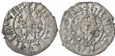
CILICIAN ARMENIA Levon I – 1199-1219