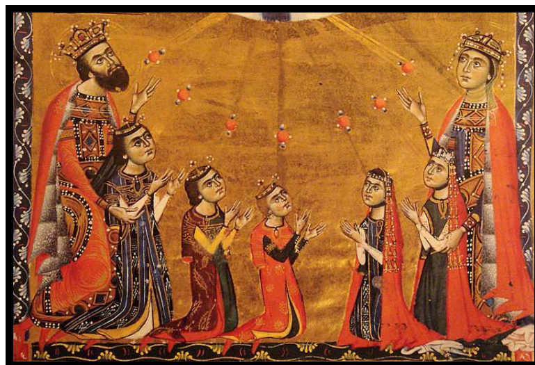
Leon II, Queen Guerane, and their five children, 1272.

Five of the fifteen children, Hetoum, Thoros, Sembat, Constantine, and Oshin, later became the Armenian kings, who often fought each other to gain the throne. Finally, it were the descendants of his daughter Isabella that would inherit the throne.