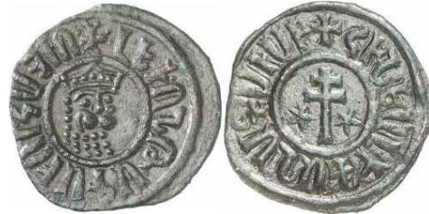
CILICIAN ARMENIA Levon I – 1199-1219

Estimate: 15 EUR. Price realized: 60 EUR (approx. 92 U.S. Dollars as of the auction date)