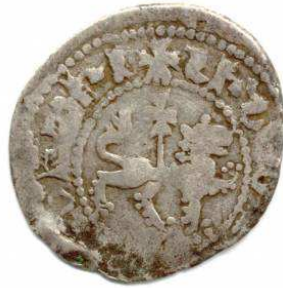
CILICIAN ARMENIA LEVON THE USURPER – 1363-1365