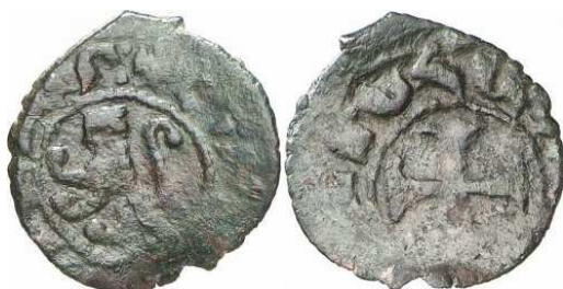
CILICIAN ARMENIA Levon V., 1374-1375.