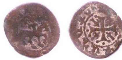
CILICIAN ARMENIA Smbat, 1269-1298.

+ ԿԱՐՈՂՈՒԹԵՆ ԱՍՏ... “By the Will of God”