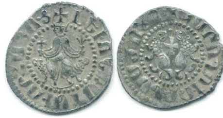
CILICIAN ARMENIA Levon I – 1199-1219