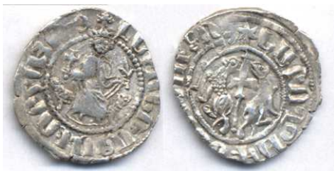
CILICIAN ARMENIA Levon I – 1199-1219