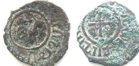
CILICIAN ARMENIA LEVON II – 1270-1289

Reverse: Lion standing to the left, patriarchal cross with two bars behind.