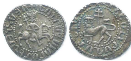
CILICIAN ARMENIA LEVON II – 1270-1289

+ՇԻՆԵԱԼ Ի ՔԱՂԱՔՆ Ի ԱԻԱ “Struck in the city of Ayas”