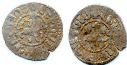
CILICIAN ARMENIA LEVON IV – 1320-1342

+ՇԻՆԱԼ Ք[ԱՂԱ]ՔՆ ՍԻՍ “Struck in the city of Sis”