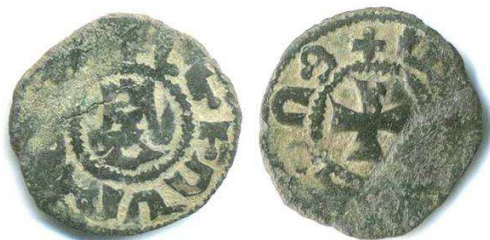
CILICIAN ARMENIA Levon V., 1374-1375.

AE "Billon." 15 mm, 1.00 gm. Wrong metal, unique.