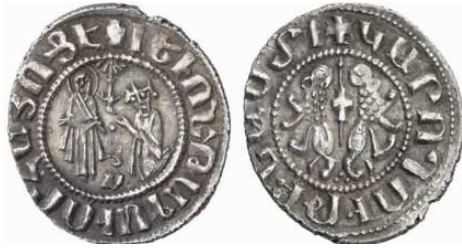
CILICIAN ARMENIA Levon I – 1199-1219