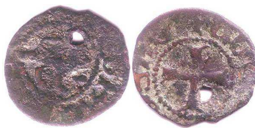
CILICIAN ARMENIA Levon V., 1374-1375.

Estimation: € 100,00. Price realized: 80 EUR (approx. 114 U. S. Dollars as of the auction date)