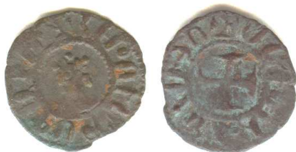
CILICIAN ARMENIA HETOUM II – 1289-1293, 1295-1296, 1299-1301, 1301-1306