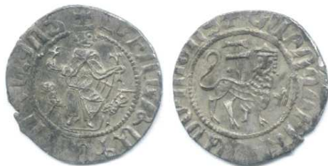
CILICIAN ARMENIA Levon I – 1199-1219

+ԿԱՐՈՂՈՒԹԵՆ ԱՍՏՈՒԾՈՅ “By the Will of God”