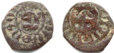
CILICIAN ARMENIA HETOUM II – 1289-1293, 1295-1296, 1299-1301, 1301-1306 AE Brockage Kardez, no mint. 21.2 mm, 3.33 g.

+ՇԻՆԵ ... ԱՔԻ “Struck in the city of Sis”