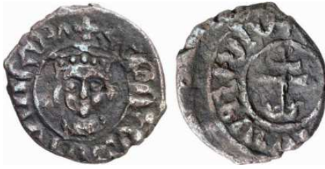
CILICIAN ARMENIA HETOUM II – 1289-1293, 1295-1296, 1299-1301, 1301-1306 Kardez. Sis mint. 4.69 g.