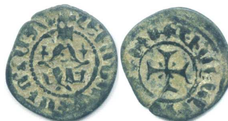
CILICIAN ARMENIA LEVON IV – 1320-1342

Estimation: € 80,00. Price realized: 64 EUR (approx. 91 U.S. Dollars as of the auction date)