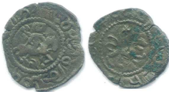
CILICIAN ARMENIA POST ROUPENIAN – AFTER 1375 ?

Notes: I recently got this poorly preserved and curious coin. At first I thought it was a copper coin of an earlier king struck with takvorin dies, but after exhaustively studying plates of coins, I could not confidently match it to any king. I suspect Oshin, but it could be a PR. Also, it is interesting to note this coin is much like the Byzantine tracheas in a "cup" shape.