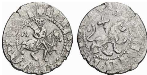
CILICIAN ARMENIA LEVON III – 1301-1307