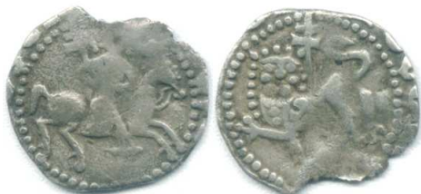
CILICIAN ARMENIA LEVON II – 1270-1289

... ՆԵԱԼ Ի ՔԱՂԱՔՆ ... “Struck in the city of Sis”