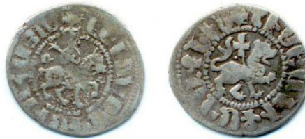
CILICIAN ARMENIA LEVON IV – 1320-1342

+ՇԻՆԵԱԼ Ի ՔԱՂԱՔՆ Ի Ս “Struck in the city of Sis”