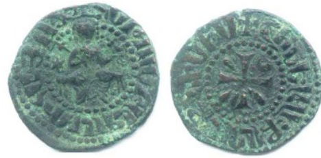
CILICIAN ARMENIA Hetoum I., 1226 - 1270.

+ՇԻՆԵԱԼ Ի Ք ... Ի ՍԻՍ "Struck in the city of Sis"