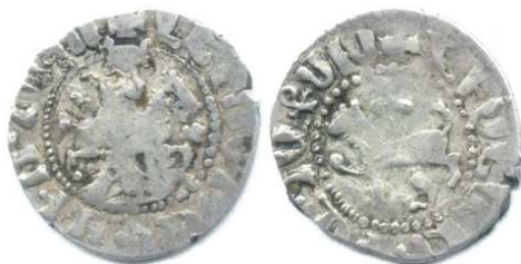
CILICIAN ARMENIA LEVON IV – 1320-1342