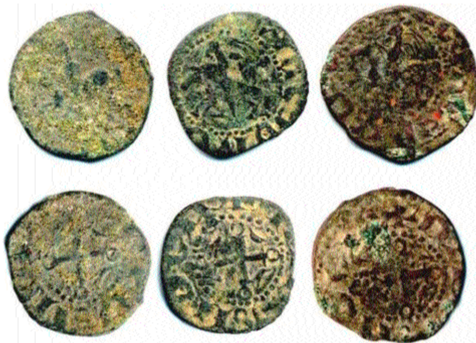
Baronial coppers of Levon II. 1187-1199

Leo was a powerful ruler, remembered by chroniclers as "Leo the Magnificent". His court at Sis was cultured and he was a supporter of calligraphy and the arts. He allied himself with the Knights Hospitaller and the Teutonic Knights, but drove the Knights Templar from his kingdom. He fostered commerce with Venice and Genoa, opening his ports at Ayas and Corycos to the world. The Assizes of Antioch were adopted as the law of the kingdom,