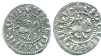
CILICIAN ARMENIA Oshin, 1307-1320.

*Note the error in the spelling of the kings name. It reads: ՕՏԻՆ, but it should read ՕՏԻՆԸ. Missing the letter Ն in the end.