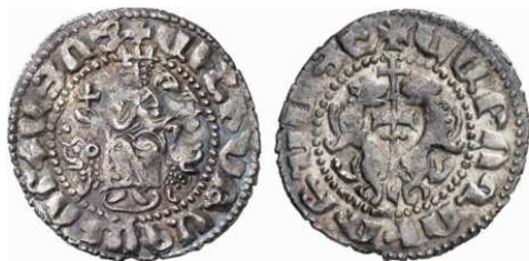
CILICIAN ARMENIA Oshin, 1307-1320.