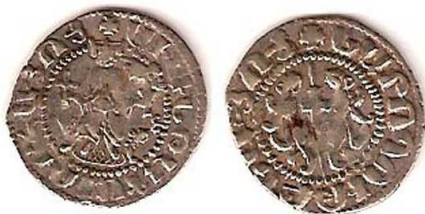
CILICIAN ARMENIA Oshin, 1307-1320.