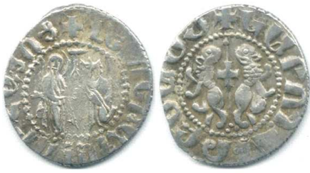
CILICIAN ARMENIA Levon I – 1199-1219