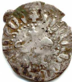
CILICIAN ARMENIA LEVON THE USURPER – 1363-1365