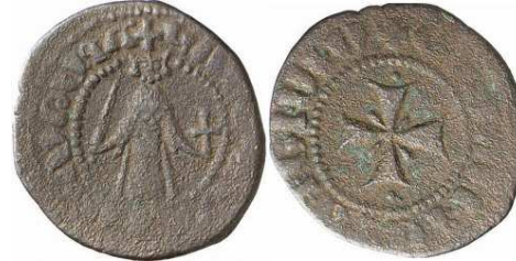
CILICIAN ARMENIA Gosdantin I – 1299

Estimate: 100 EUR. Price realized: 420 EUR (approx. 644 U.S. Dollars as of the auction date)