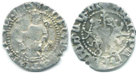
CILICIAN ARMENIA Smbat, 1269-1298.