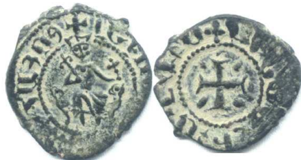
CILICIAN ARMENIA LEVON III – 1301-1307