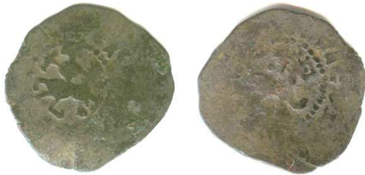
CILICIAN ARMENIA POST ROUPENIAN – AFTER 1375 ?