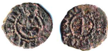
CILICIAN ARMENIA LEVON III – 1301-1307