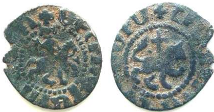
CILICIAN ARMENIA Oshin, 1307-1320.

On his death on July 20, 1320, Oshin was succeeded by his minor son Leo V. Oshin was popularly believed to be poisoned by his cousin (and brother-in-law) Oshin of Corycos.