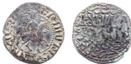
CILICIAN ARMENIA Hetoum I., 1226 - 1270.

(Struck in Sis, the year seven and | thirty | - | and six hundred.) Notes Bears some traces of overstrike. Probably struck over a Seljuq dirham of Kayqubad from the Konya mint.