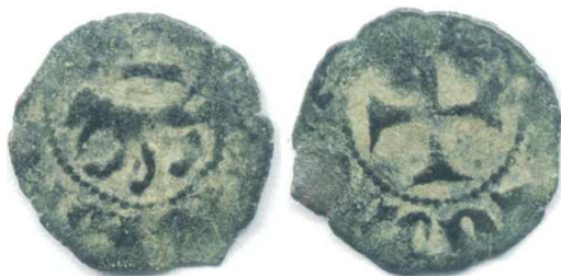
CILICIAN ARMENIA Levon V., 1374-1375.