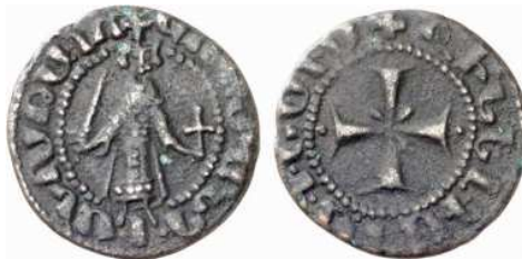
CILICIAN ARMENIA Gosdantin I – 1299