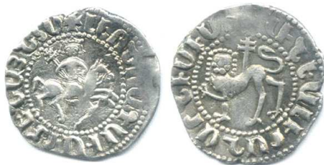
CILICIAN ARMENIA LEVON II – 1270-1289

+ՇԻՆԵԱԼ Ի ՔԱՂԱՔՆ Ի ՍԻԱ “Struck in the city of Sis”