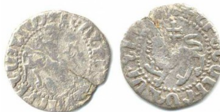
CILICIAN ARMENIA LEVON II – 1270-1289

+ՇԻՆԵԱԼ Ի ՔԱՂԱՔՆ Ի ՍԻԱ “Struck in the city of Sis”