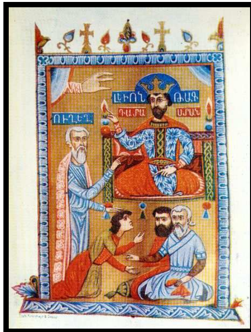
King Levon IV doing justice by Sarkis Pitzak, 1331

Leo was strongly pro-Western and favored a union of the Armenian and Roman Churches, which deeply displeased the native barons. His second marriage on December 29, 1331 to Constance, daughter of Frederick III of Sicily and Eleanor of Anjou, widow of Henry II of Cyprus, further aroused anti-Western sentiment. In 1337, Al-Nasr Muhammad invaded again, taking the city of Ayas, and Leo was forced to conclude a humiliating truce, surrendering territory and a large indemnity and promising to have no dealings with the West. He spent the last years of his reign holed up in the citadel at Sis, hoping for Western aid. On December 28, 1341 he was murdered by his own barons. His only son by Alice, Hethum, had died before 1331; the barons elected his cousin Guy of Lusignan to succeed him.