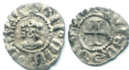
CILICIAN ARMENIA HETOUM II – 1289-1293, 1295-1296, 1299-1301, 1301-1306