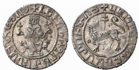
CILICIAN ARMENIA Levon I – 1199-1219

+Կ ... ԹԸՆ ԱՍՏՈՒԾՈՅ “By the Will of God”