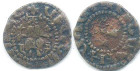
CILICIAN ARMENIA Oshin, 1307-1320.