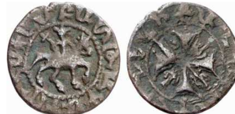
CILICIAN ARMENIA Smbat, 1269-1298.

Estimate: 25 EUR. Price realized: 40 EUR (approx. 61 U.S. Dollars as of the auction date)